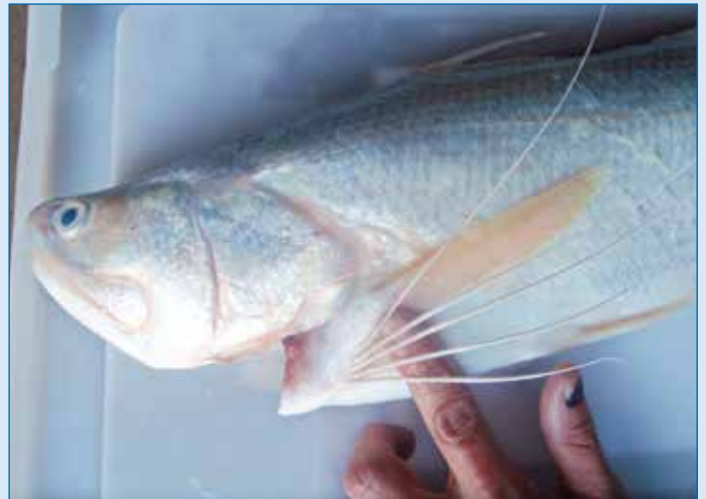
King threadfin showing the diagnostic characteristic of 5 free pectoral filaments.