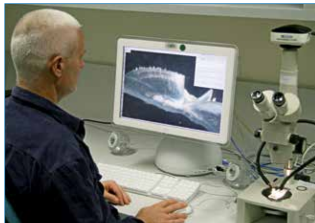
A Department of Fisheries research scientist analyses the ear bone of a fish.

Fish use otoliths for balance and to hear underwater. Growth rings are added to otoliths, similar to growth rings in a tree. These growth rings are added every season – some are translucent, others opaque – creating banding. Each set of bands represents a year's growth. Researchers count the growth rings to age a fish and build a picture of the age make-up a fish population. This information will be used to manage threadfin stocks across northern Australia.