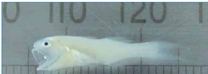
From tiny threadfin fry like this one, mighty adult fish can grow.