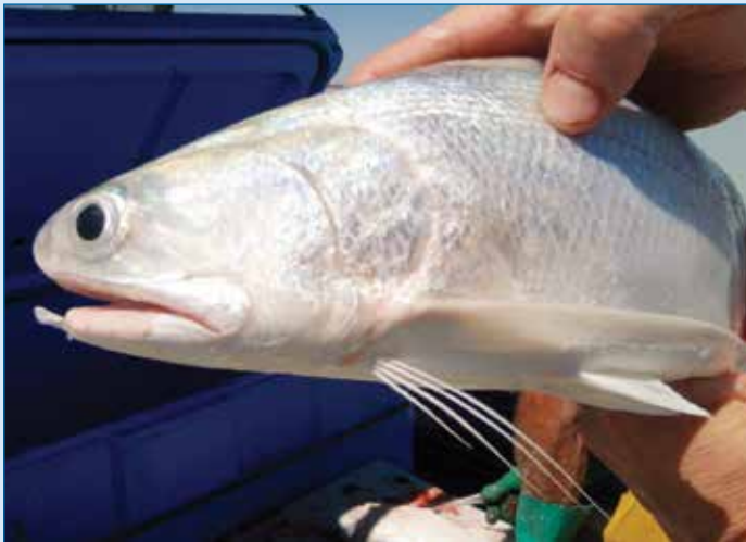
Blue threadfin showing the obvious diagnostic characteristic of 4 free pectoral filaments.

King threadfin are a large species that have five pectoral filaments, and vivid yellow pectoral and pelvic fins. Often the overall colouration is golden silver to yellowish white.