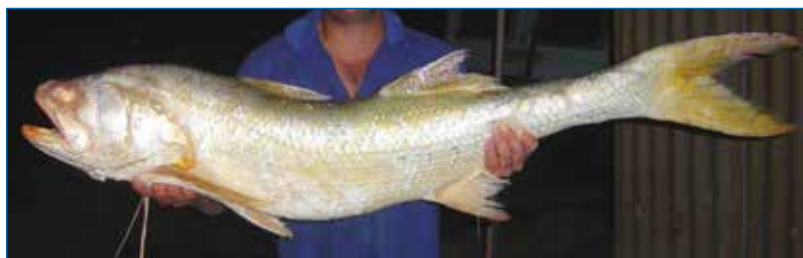
King threadfin caught by commercial gill net at Anna Plains (139 cm total length).

Both king and blue threadfin share similar habitats in coastal inshore waters. Juvenile threadfin mainly live in shallow inshore waters, where tiny invertebrates such as prawns, crabs and worms are abundant. Adult threadfin also favour estuarine areas and coastal waters, where large schools come together in tidal flats and river mouths around autumn and spring. There they search for food in the sand and mud.