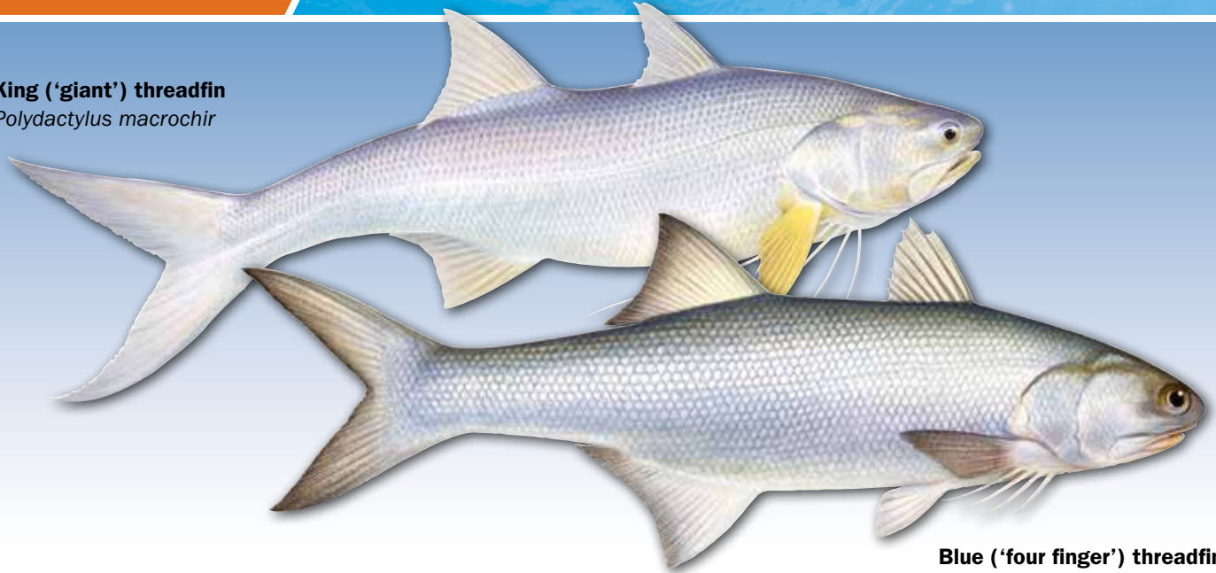
Blue ('four finger') threadfin Eleutheronema tetradactylum