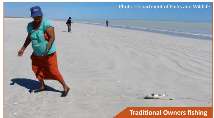
Traditional Owners fishing

only be conducted by recognised Traditional Owners, or where Traditional Owners have provided consent to another Aboriginal person or group.