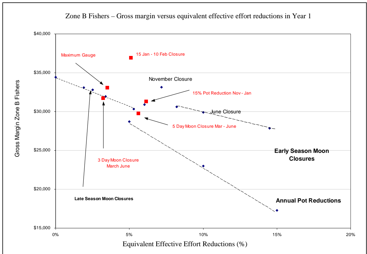
Figure 2: The relative impact of different proposed effort reduction strategies in Zone B on Zone B fishers (note that the impact on Zone A fishers is not depicted).

Note that the points denoted as squares are new strategies, while the points denoted as diamonds are the strategies considered earlier in the year.